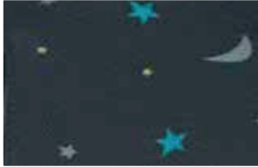
Kid*ab*ra fabric standard on paediatric sizes