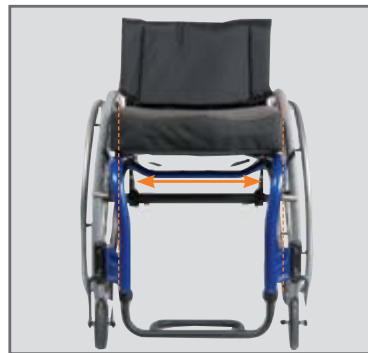
Optional 1" frame inset