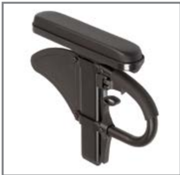
Low Profile, Single Post Armrest