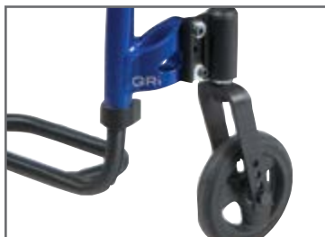
Stable, adjustable caster design