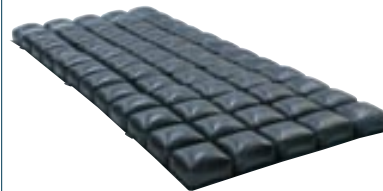
PRODIGY MATTRESS OVERLAY®