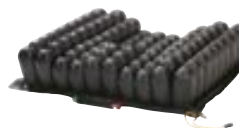
CONTOUR SELECT™ CUSHION