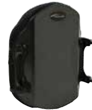
JETSTREAM PRO® BACK SUPPORT SYSTEM

FOR ADDITIONAL INFORMATION, PLEASE CONTACT: