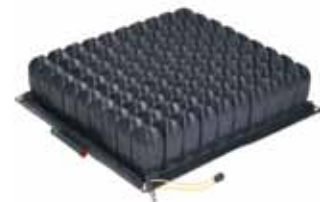
HIGH PROFILE® QUADRO SELECT®