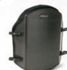
Jetstream Pro™ Back Support System